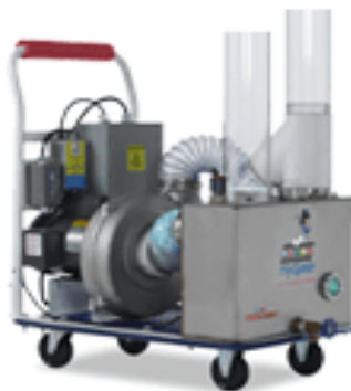
Shown with clear hard plastic air conveyance lines for fixed location.

AIR CONVEYANCE LINES NOT INCLUDED IN THE PRICE OF THE MACHINE.