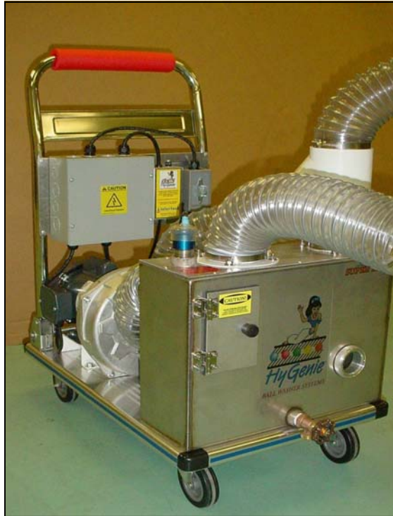
SHOWN WITH FLEXLINE AIR CONVEYANCE