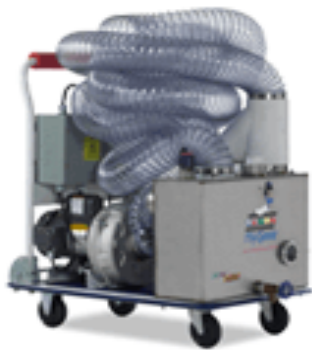
Shown with flexline air conveyance for mobile use.

Adaptable for 50 hertz countries, with the factory installed cycle inverter .