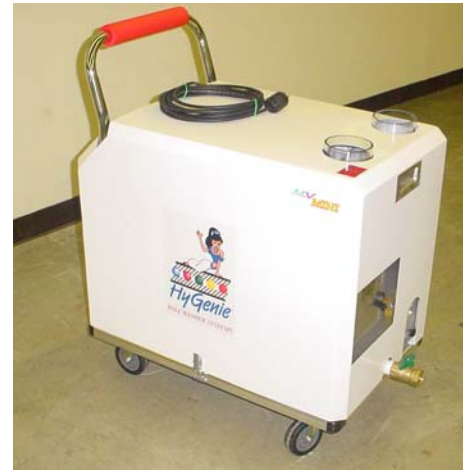
SHOWN WITH Optional COVER