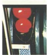
View of balls entering cleaning brushes